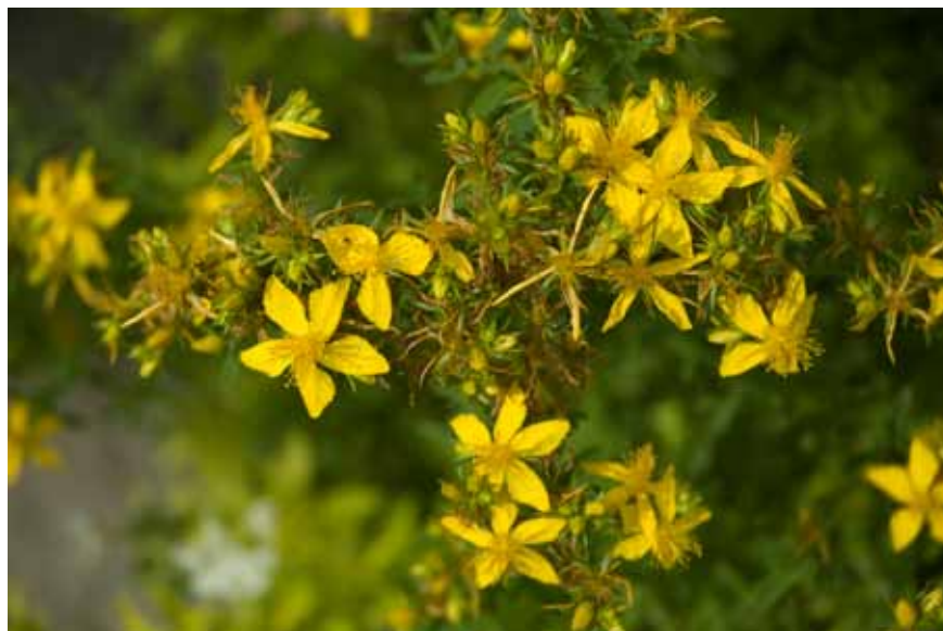
St John's Wort

A useful remedy used as a tea or syrup for chest infections, even proving helpful in more serious problems such as bronchitis, whooping cough and pleurisy. The volatile oils in thyme are both antiseptic and expectorant, helping to clear infections and make mucous secretions thinner and therefore easier to cough up. The oils also help relieve muscle spasms; very useful for the tightness that often accompanies chest infections. Thyme is an anti-fungal in conditions like ringworm and athlete's foot. Research suggests that thyme and its volatile oil have a significant tonic effect, supporting the normal functioning of the body and countering the effects of ageing.